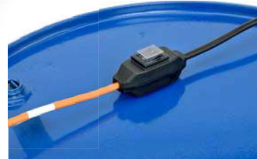
Large splash-proof cord switch

Diesel/biodiesel AUS 32 (AdBlue®) Fresh water Antifreeze liquid