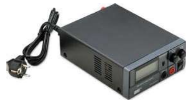
Cable connection directly on the 230 V power pack (variants 10590, 10591, 10592)