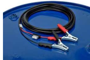
4 m cable with crocodile clips and blade fuse (variants 10488, 10489, 10490)