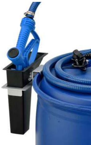
Optional accessory: dispensing nozzle holster