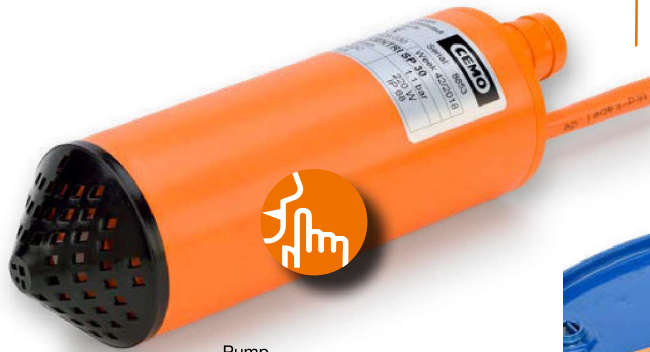
Pump CENTRI SP30 EXTREMELY QUIET

Diesel/biodiesel AUS 32 (AdBlue®) Fresh water Antifreeze liquid