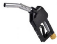
Piusi A60 automatic nozzle