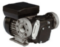
Piusi Panther 72 pump