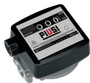
K33 mechanical flowmeter