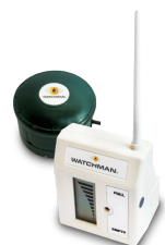
Watchman Sonic Plus leak and level sensor