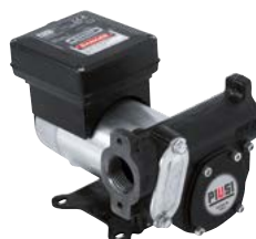
DC PUMP - PANTHER DC