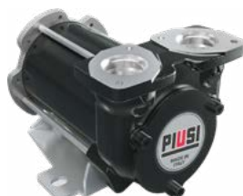
DC PUMP - BP3000