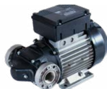
AC PUMP - E120