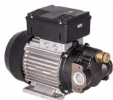
AC PUMP - VISCOMAT VANE