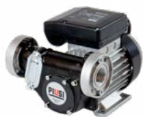
AC PUMP - PANTHER