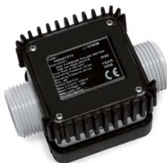
K24 PULSE METER